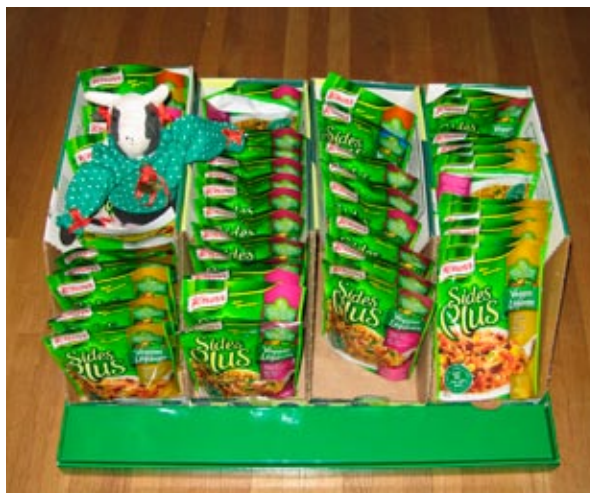
55 sidekicks for $5!

Getting the card is quick and easy. Contact us about how to donate your points.